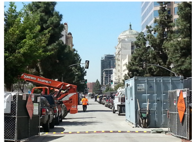
Picture above: Mixed-use project on Grand/Olive & 8 th Street closed two lanes, curbside parking, and sidewalk on both Grand Ave. and Olive St. for construction staging. Currently, this area is being used for two lanes of parking and a through lane drive aisle. This project will close down sidewalks on Grand, Olive, and 8 th Street for approximately (3) years total.