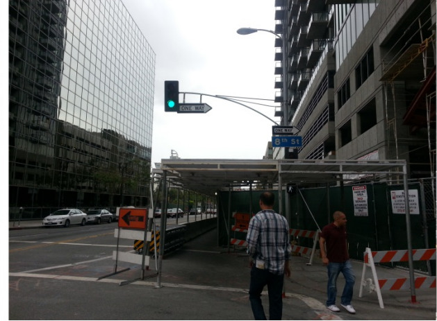
Picture above: Picture of pedestrian access along construction fence in front of new high-rise construction on Hope St. and 8 th St. This should be a requirement for all construction sites in Downtown LA.

On the 6 block stretch of Olive Street between 7th and Pico, every block will have one or more new ground up construction that will require sidewalk/lane closures. DLANC recently received a complaint from 123 Refills, a small business located just north of the sidewalk/street closure on Olive (705 S. Olive Street) regarding a loss of business due to sidewalk closure and reduced pedestrian activity.