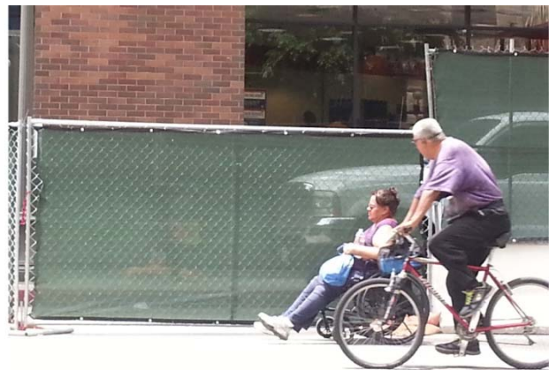
Picture above: A woman in wheel chair on 7 th Street in front of Macy's sidewalk closure