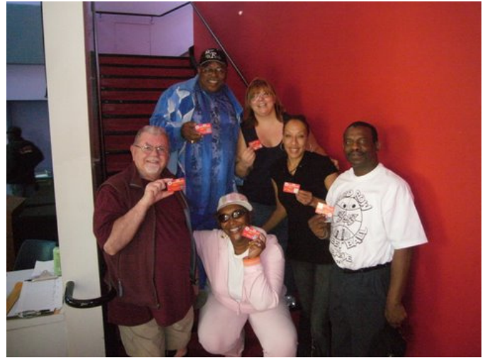
On Saturday June 6, members of the Affordable Housing Committee distributed tv converter box coupons to residents of SROs downtown as part of the ongoing Neighbor-to-Neighbor program (above). The Sustainability Committee looks for community feedback on public spaces downtown as it develops a community greening strategy (below).