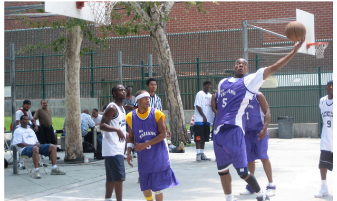
The Neighborhood Council supports healthy year-round recreation downtown such as the Skid Row 3-on-3 Basketball League at Gladys Park.